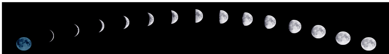
14-15 moon phases from New Moon (a Holy Day) to full moon; two phases of waxing and waning (29-30 total) The illustration on the preceding page assumes the reader is facing north. Reading left (west) to right (east) and goes from New Moon (day 1) to full moon (day 15). The phase and position of the moon in the sky simulates its waxing (getting larger) at sunset each successive night of the month. Waning is just the opposite, the moon decreasing in size and its similar phase seen at sunrise, as well as portions of the day.

Scripture tells us that we will return to the Holy Days to properly remember our Lord and worship Him as He desires, or there will be cursing, plagues, etc. This is the last-days prophecy of Zechariah 14:16-18. There we read, “And it shall come to pass, that every one that is left of all the nations which came against Jerusalem shall even go up from year to year to worship the King, the Lord of hosts, and to keep the feast of tabernacles. And it shall be, that whoso will not come up of all the families of the earth unto Jerusalem to worship the King, the Lord of hosts, even upon them shall be no rain. And if the family of Egypt go not up, and come not, that have no rain; there shall be the plague, wherewith the Lord will smite the heathen that come not up to keep the feast of tabernacles.”